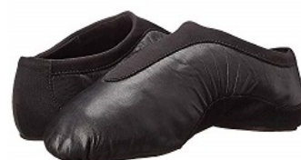
BLACK SLIP-ON JAZZ SHOES